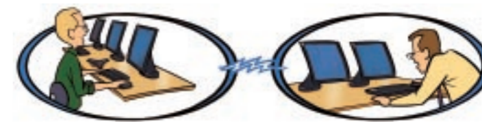
Instructor can view RCI student's PC and offer assistance.

Both are Live, Hands-on, Interactive Instruction. The major difference between traditional and RCI training is that with RCI, the instructor is at a different site. RCI students have the same materials and computer labs. They can talk with the instructor and other students plus see all of the presentations on the whiteboard and computer. The instructor can view the RCI student's screen at all times and even take control of their PC to provide personal assistance.